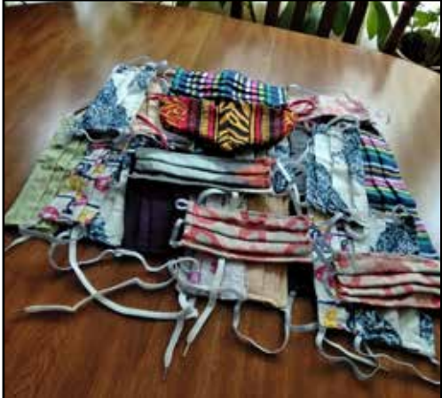
Kershaw County made personal masks to share with those in need to help stay safe during the COVID-19 pandemic.